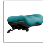
9 Seat Large, Deep Contour