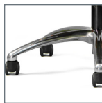
B6 26" Polished Aluminum