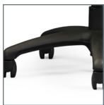
B0 Standard 26" Black