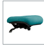
8 Seat Large, Minimal Contour