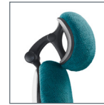
H4 Dual Pivot