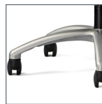
B8 27" Brushed Aluminum