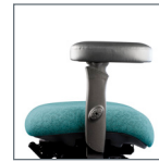
7 Arm Oversized Fabric/ Leather Arm Pads