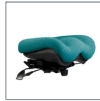
7 Seat Medium, Deep Contour