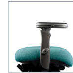
P Arm 360° Swivel