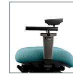
9 Arm Ball Bearing Tracker