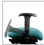
4 Arm Swing