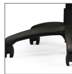
B12 28" Black