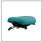
5 Seat Medium, Minimal Contour