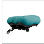
6 Seat Medium, Moderate Contour