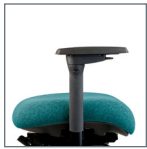
0 Arm 5-way 360°