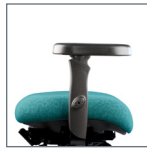
3 Arm 360° Swivel w/ Oversized Urethane