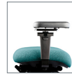
8 Arm Friction Tracker